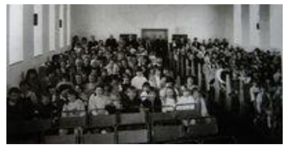
Morning congregation on Sunday 17th April 1983.