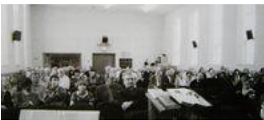
Church activity and services, Easter Sunday 2008.