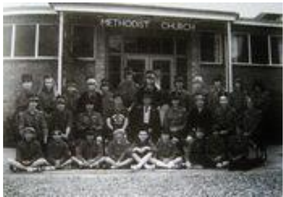
Leaders and Members of the 4th Sprowston (Methodist) Guides, date early 1980's.