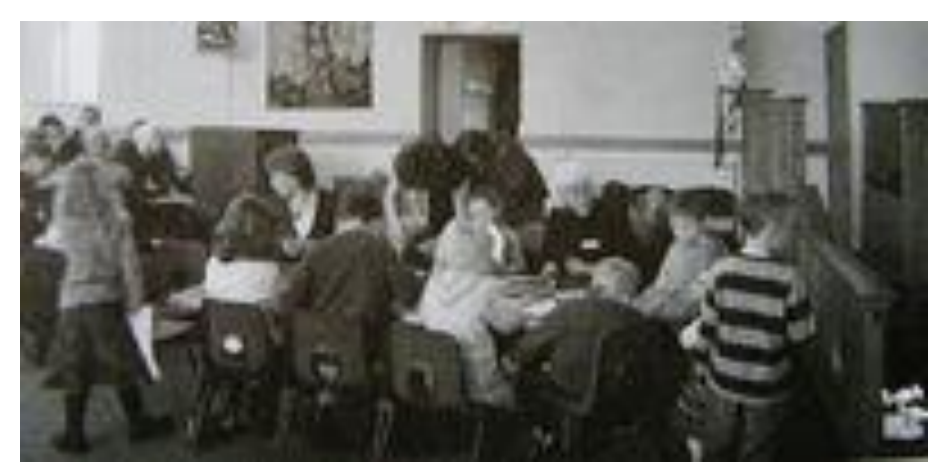
Church activity and services, Easter Sunday 2008.