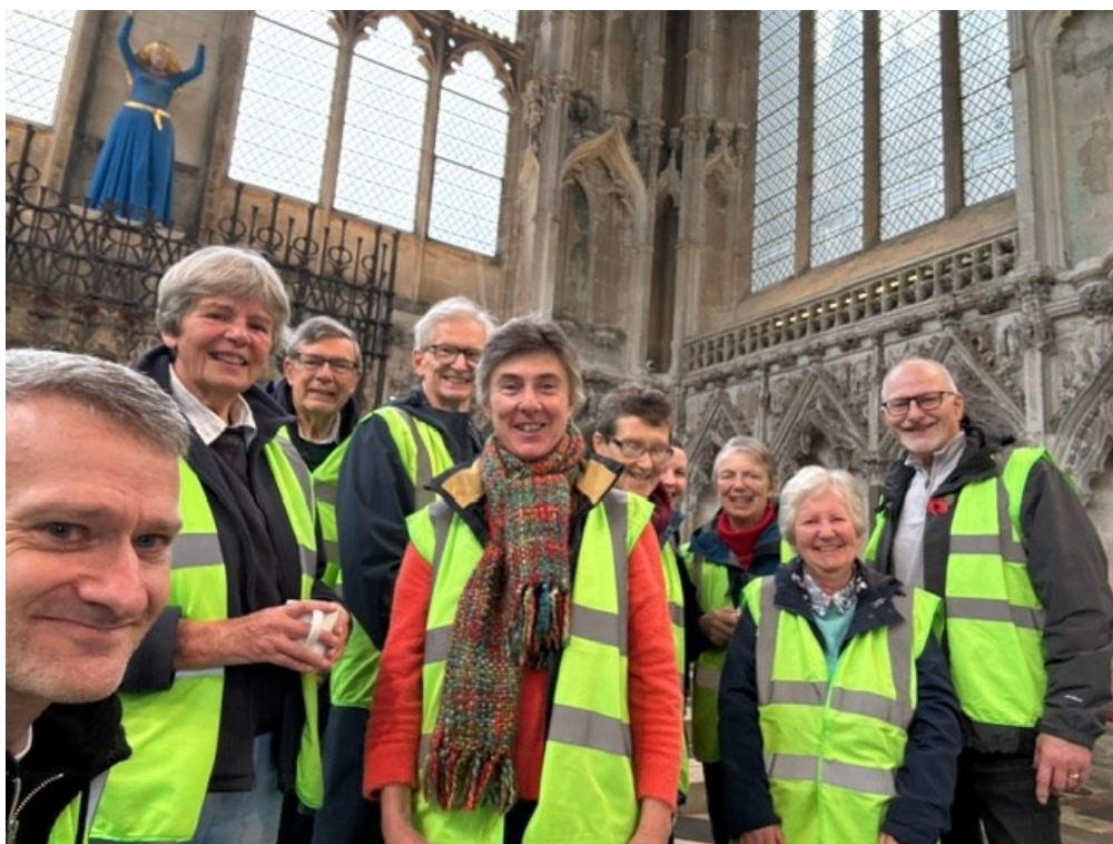
Litter pickers from Ely Methodist Church and the Cathedral enjoying a break in the Lady Chapel at Ely Cathedral.