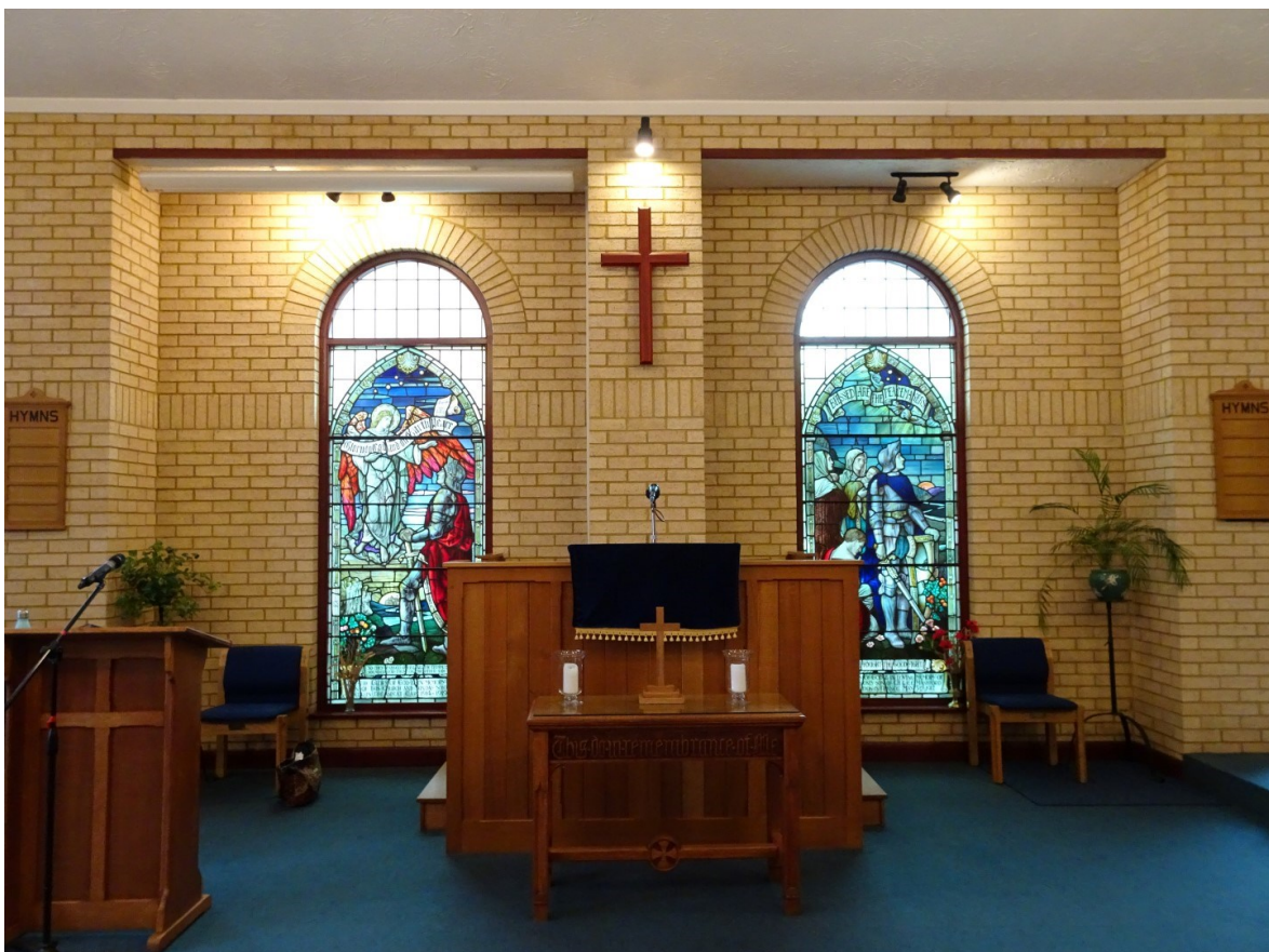
Holbeach Methodist Church

District EDI Officer and East Anglia District MWiB President Elect