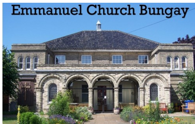
Emmanuel Church achieved their Gold Eco Church Award in 2022

We also collect used printer cartridges, old bras for Bra Aid, old spectacles for Vision Aid and kitchen roll tubes, Pringle lids & plastic bottle tops to sell on Ebay for art & craft materials. Many schools, groups and individuals buy them for their